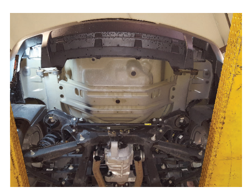
817483 Rev 03/26/20